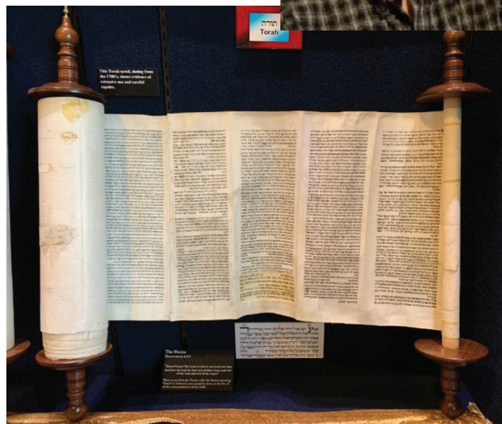
Torah Scroll from the 18th century.