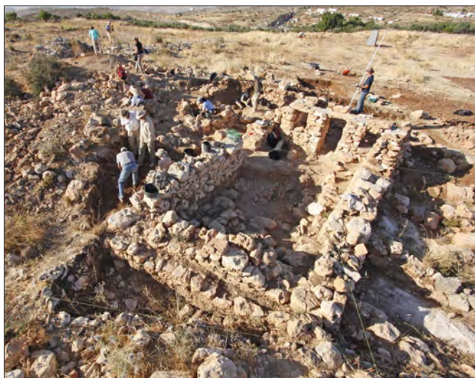
Khirbet el-Maqatir excavations uncovered a first century house with numerous coins from the New Testament era, which will be on display at the special exhibit.

Throughout 2014, the Dunham Bible Museum will host a special archaeological exhibit: Khirbet el-Maqatir: History of a Biblical Site . Khirbet el-Maqatir is possibly the site of ancient Ai, the city Joshua conquered after the fall of Jericho (Joshua 7-8). The Civil Administration of Judea and Samaria has approved the loan of 40 artifacts from the excavations for the exhibit at the Dunham Bible Museum January 20 – December 19, 2014.