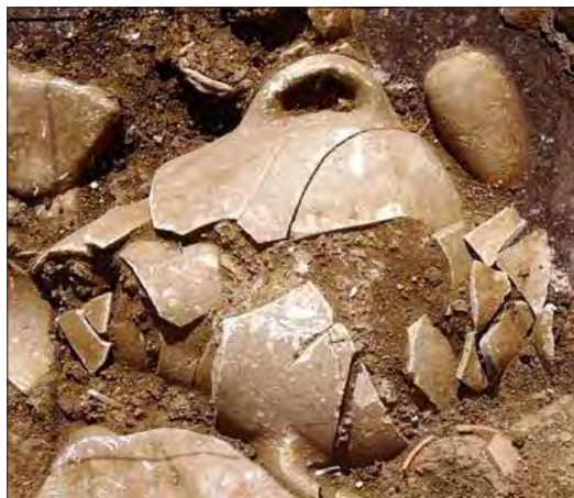
Infant Burial Jar from the Khirbet el-Maqatir excavations will be part of the upcoming exhibit.

Jerusalem University College (and whose Bible collection is now at the Dunham Bible Museum) will consider archaeological contributions to our knowledge of Jesus in the Holy Land.