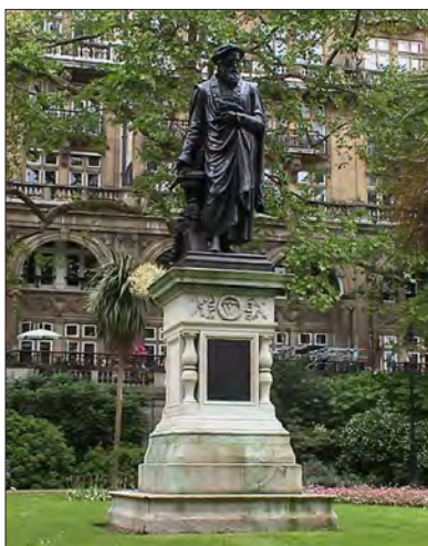
Statue of William Tyndale in London