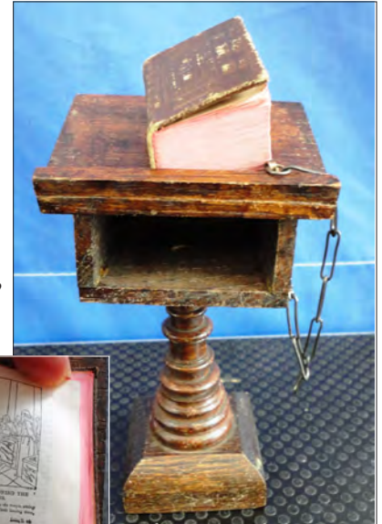
Miniature Pulpit with Chained Bible, 1911. The smallness of the Bible can be seen relative to the fingers holding the Bible.

Standing tall among the miniature book display is a miniature Bible chained to a miniature pulpit. When Henry VIII first allowed English Bibles in England and ordered a Bible available in every parish church, Bibles were chained to pulpits or reading stands to prevent theft and insure the Bible would be available for all to read. The miniature pulpit and chained Bible, a recent Museum acquisition, was made as a commemorative souvenir for the tercentenary of the King James Bible in 1911. The binding of the miniature Bible, printed by Oxford University Press, purportedly recreates the binding of William Shakespeare’s family Bible, and the pages between