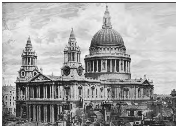
Tyndale’s translation into English of the New Testament was printed abroad, smuggled into England - and then burned in front of St. Paul’s Cathedral, since the Bible in English was illegal at the time.