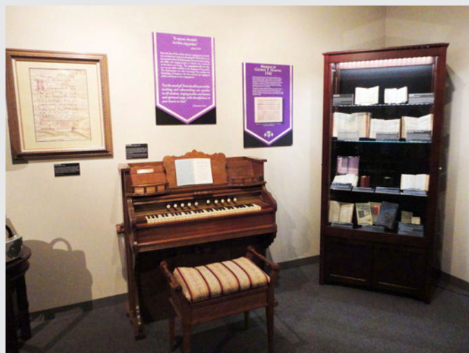
Exhibit of psalters and hymnals now in the Lyceum of the Dunham Bible Museum

Also new in the Lyceum is a digital display of quotations of famous people about the Bible, its influence, and importance. Included among the quotations of 40 world leaders is one by George Washington: "It is impossible to rightly govern the world without God and the Bible."