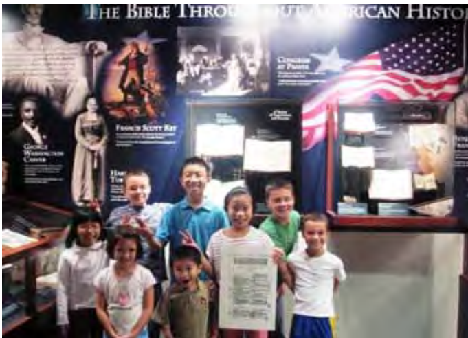
A group of homeschooled students enjoyed visiting the Dunham Bible Museum. 22 school groups toured the Museum during the 2011-2012 school year. These included students from public and private schools, home schools, and confirmation classes.

The Dunham Bible Museum is among more than 1,500 museums across America offering fee admissions to all active duty military personnel and their families from Memorial Day through Labor Day 2012. We look forward to meeting many of our troops and their families at the Dunham Bible Museum this summer!