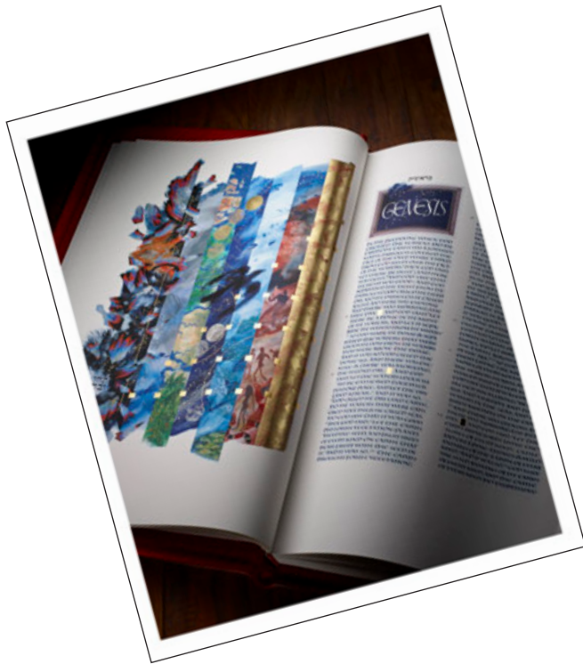
The opening page of Genesis in volume 1 of the St. John's Bible beautifully depicts the seven days of creation week.

With three volumes now in the Dunham's collection, funds continue to be sought to purchase the remaining four Old Testament volumes, at the cost of $20,000 per volume. Donations in any amount are welcome. Some donors may wish to donate an entire volume in honor or memory of a special person. All donations are tax-deductible.